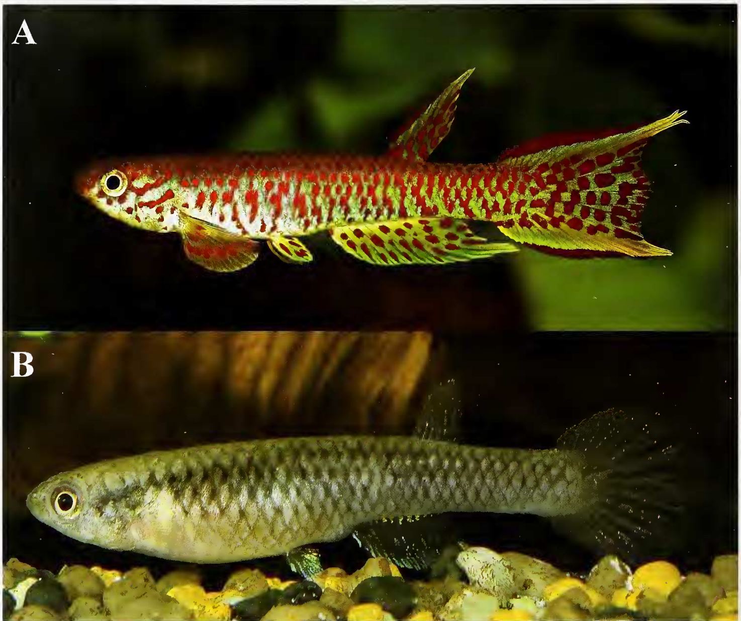
Fig. 4. A) Male of Aphyosemion elegans , commercial import (2006) from the Tshuapa River near Boende, not preserved. B) Female Aphyosemion elegans , commercial import (2006) from the Tshuapa River near Boende, not preserved.

tudinal series 28–30, with two scales posterior to hypural plate; seven transversal scales, 12 scales around caudal peduncle.